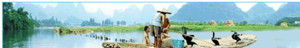
Small group tours to China : Small to be comfortable, small to be flexible and small to be cared specially!

China Guide | China Tours | China Tour Packages | Tibet Tour | Beijing Tour | Shanghai Tours | Xian Tours | Yangtze Cruises Guilin Tour | Yangtze River Cruise | Beijing Travel | Tibet Travel | China Forum | Canton Fair | Beijing 2008 | China Visa Popular Hotels in China : Beijing Hotels , Shanghai Hotels , Guangzhou Hotels , Xian Hotels , Beijing Hotel Comments , Shanghai Hotel Comments , Guangzhou Hotel Comments , Xian Hotel Comments , Guilin Hotel Comments .