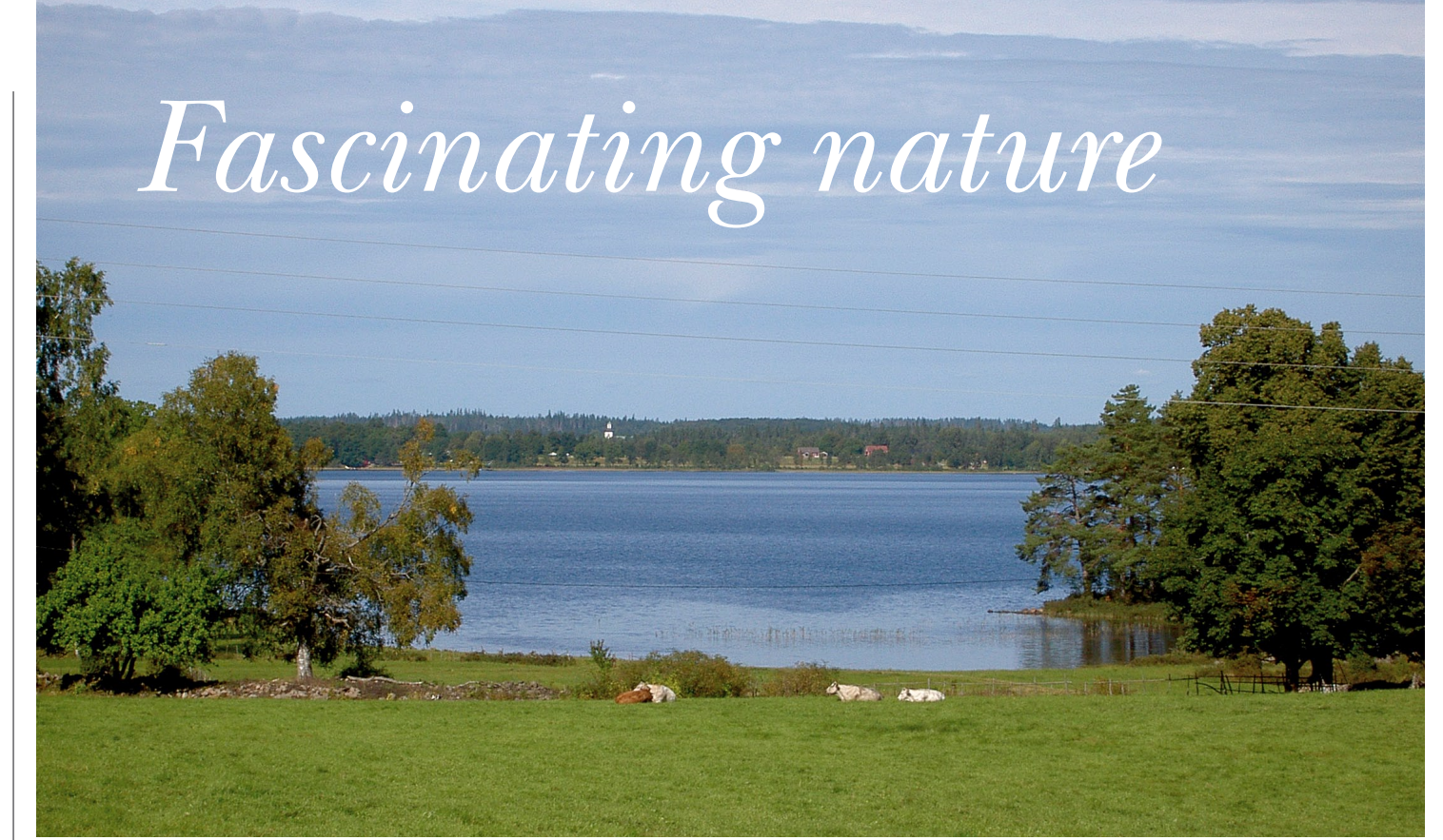
The Nässja landscape offers scenic views. Here, towards the north with the church of Unnaryd at a distance.

It is possible to see Sjö from the southern tip of the Nässja Peninsula. A clearly visible hollow-way leads from the western tip of the peninsula to the village. This road bear witness of transport efforts. For centuries, ox-cart loads were transported between the lake and the village. Wagon wheels and hooves of oxen have worn away the soft ground.